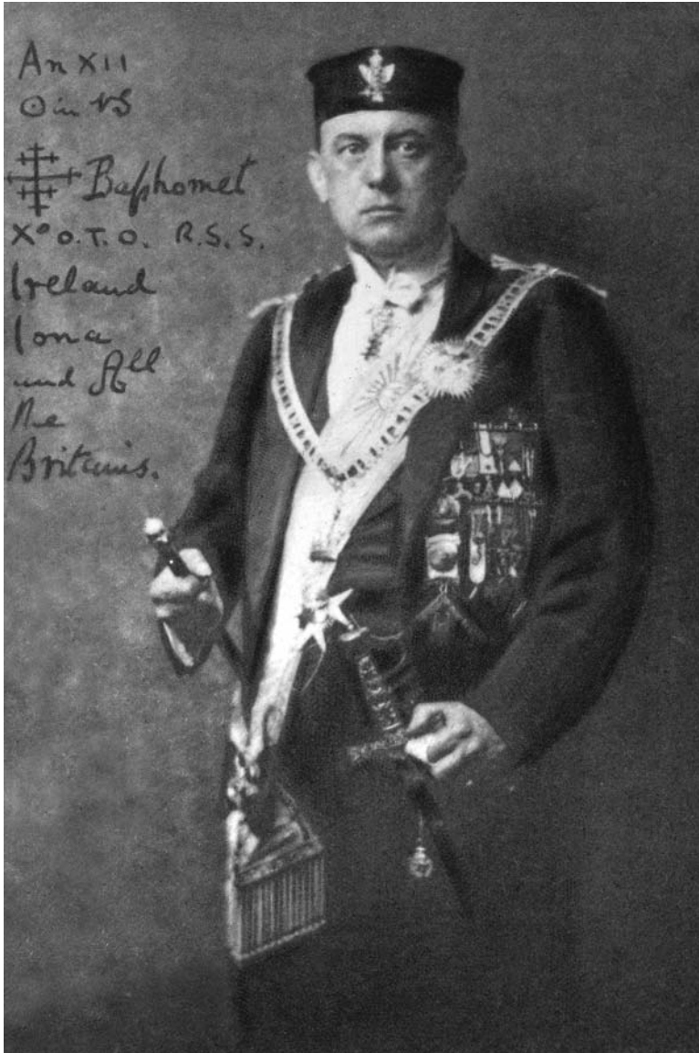
Aleister Crowley, "Baphomet XI° O.T.O., Supreme and Holy King of Ireland, Iona and all the Britains that are in the Sanctuary of the Gnosis." (1916). Portrait by Arnold Genthe. The Equinox vol. 3 (1919), no. 1. From the collection of the author.